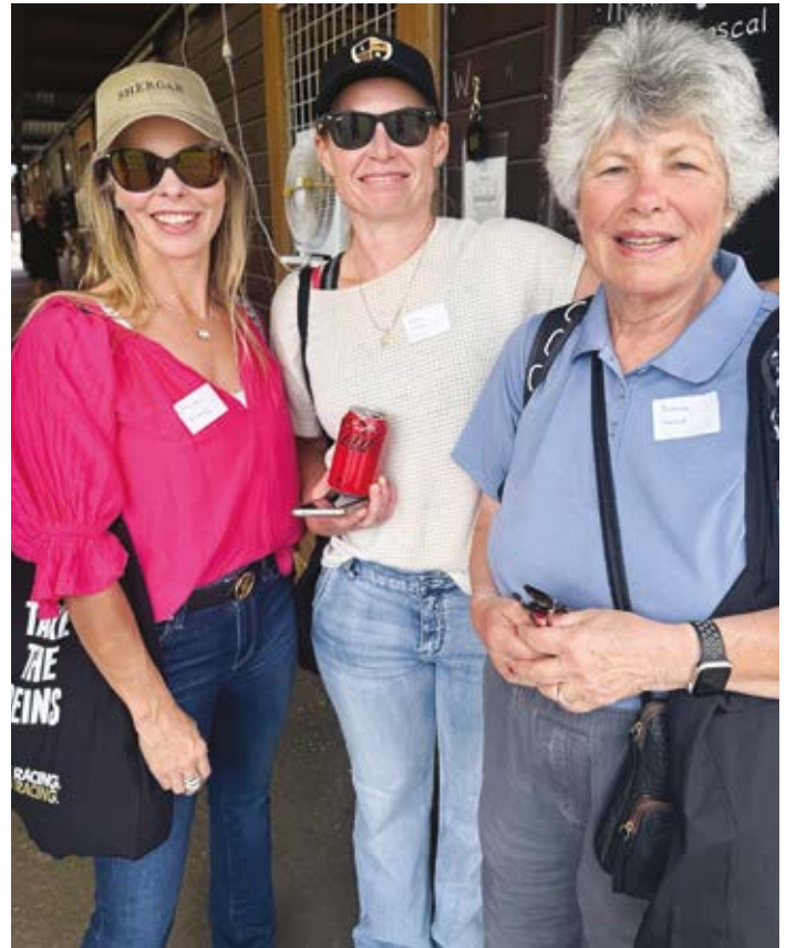
'Racehorse Ladies' at the Sales

Good luck to everyone Racing in the upcoming summer/autumn period. 🍷