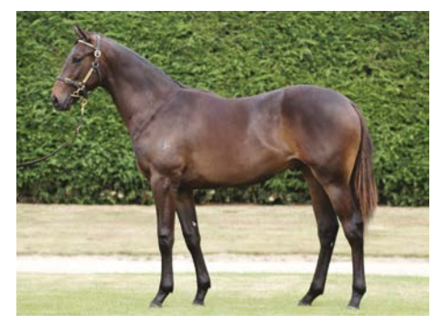
LOT 505 SAVABEEL X CAMILLINO COLT

The recent stakes performances from Marble Arch and Mrs Chrissie in Melbourne point to them getting well-deserved black type shortly and adding to Per Incanto's 32 individual stakes winners.