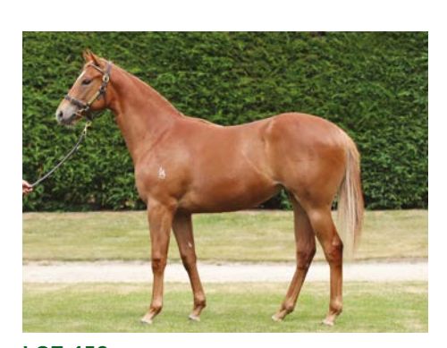
LOT 459 RUSSIAN REVOLUTION X ASSERTIVE NATURE FILLY

Recently the National Stud in England announced the sale of Time Test to Turkey. This brings an end to Time Test shuttling to LA. Ironically the stallion is having his best domestic season by some way, which should translate into returns for those breeders that have supported him over the last couple of seasons.