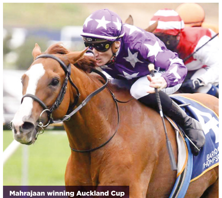
Mahrajaan winning Auckland Cup

LEGENDS DAY AT TE RAPA was a fantastic event for racegoers, and it was great to see the legends parade before each race. The emphasis put on the "Horse" as the main event of a race day was wonderful to see. Those paraded were Ping Hai Star, Werther, Sacred Star, Gingernuts, Seachange, Sir Slick, Xcellent, Mufhasa, and Bostonian. Xcellent and Sir Slick were the granddaddies of the event, both being 22 years of age. All the horses looked in great order and many showed they were keen to be at the races.