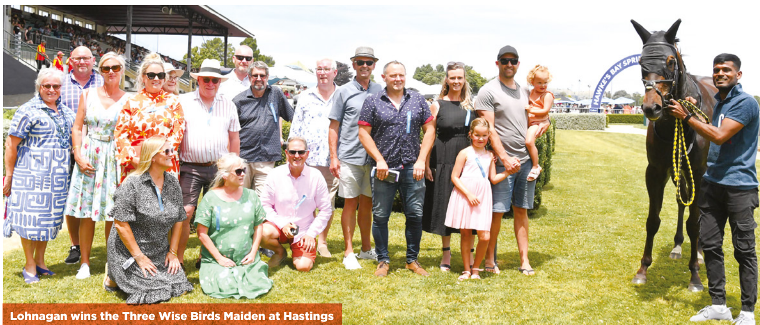
Lohnagan wins the Three Wise Birds Maiden at Hastings

El Vencedor currently holds a one point advantage over Town Cryer in the Majestic Horse Floats Points Series but with both horses unlikely to race again this season the chasers do have a chance to dispute the final result.