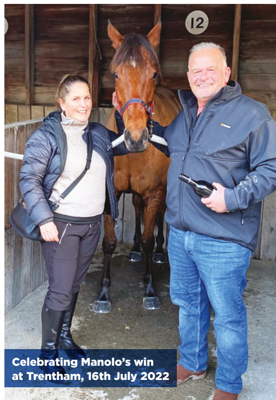
Celebrating Manolo's win at Trentham, 16th July 2022