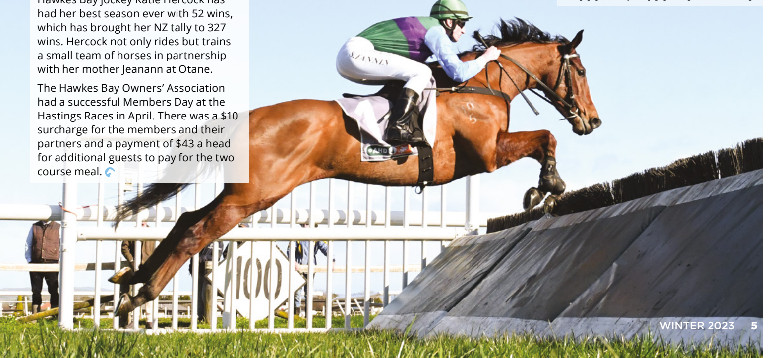
Happy Star, happy day at the Bay