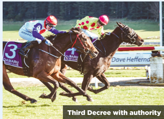
Third Decree with authority