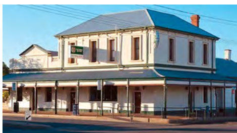
The Royal Hotel

But, after more than a dozen phone calls to and fro to various patrons of the table of knowledge, poor old Charlie had got himself in a knot. It was officially decided Under The Louvre was the main