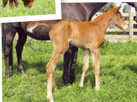
▶ Just 12 hours old Jakalbery, Escaline filly foal (see breeding story page 7) Alan Groves