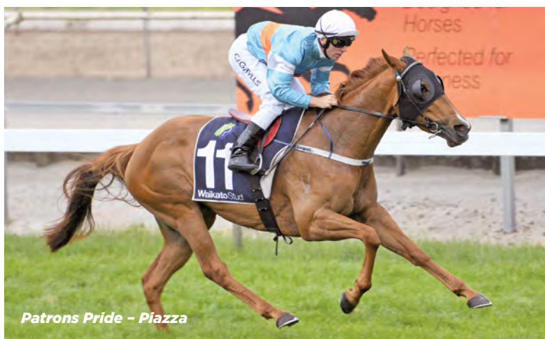
Patrons Pride – Piazza