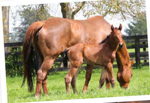
▲ 'In My Likeness' Boundless with 4 day old Savabeel colt foal Brent Taylor, Trelawney Stud