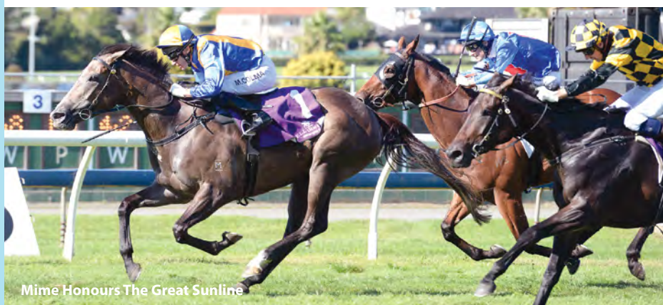
Mime Honours The Great Sunline

The Bi-Monthly Trophy is in its 20th year and 120 trophies have been presented to local Owners in this time.