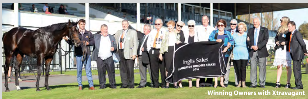
Winning Owners with Xtravagant

It's far better than the horse behind the pipe rail looking over people heads and all it took was the common sense to marshal the owners in a line and introduce the horse at the end of it. Top marks for that, Waikato Racing!